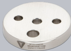
Replaceable Inlet Seat